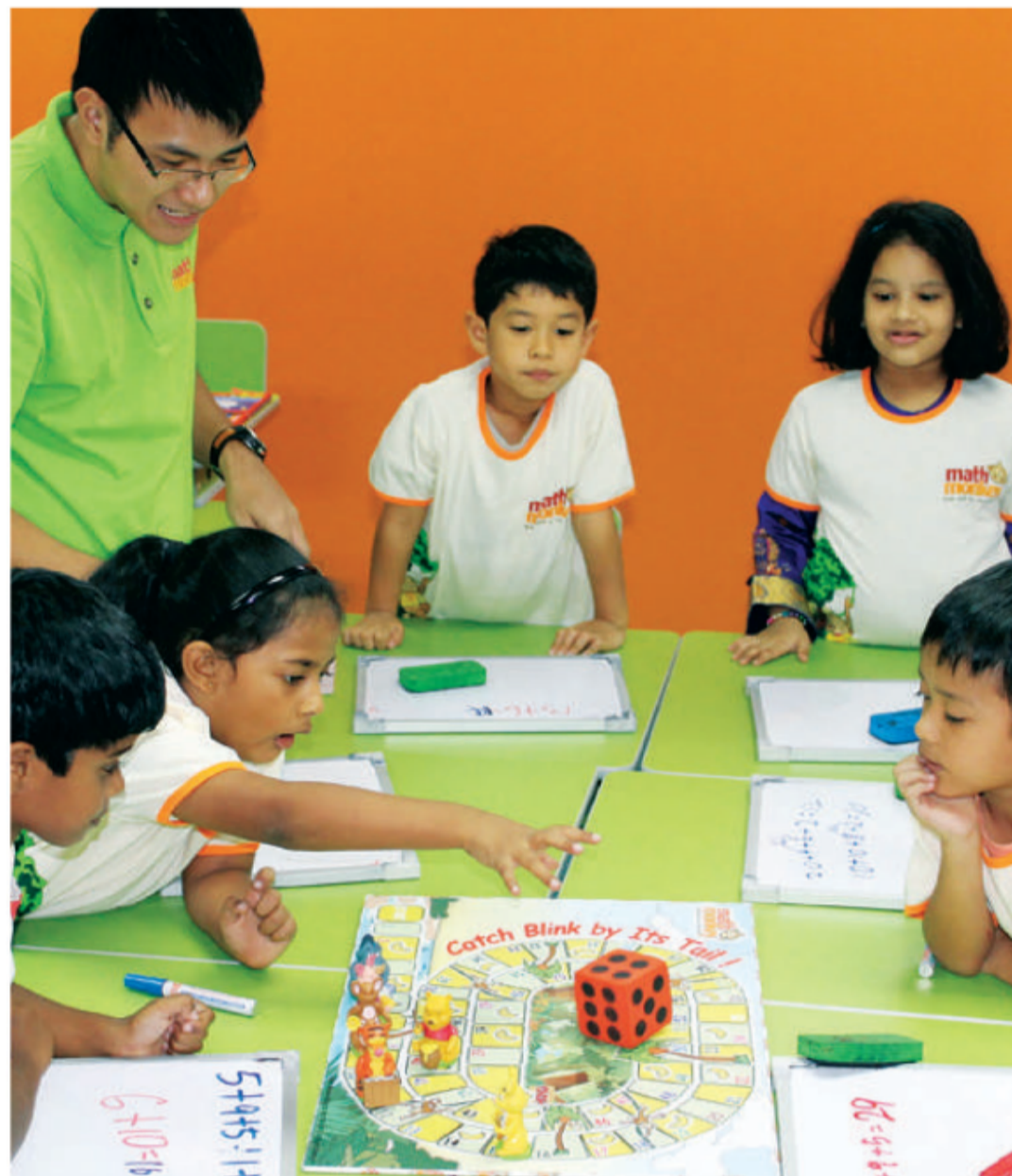
The games-based lessons at Math Monkey sparks children's interest in mathematics.

Math Monkey (M) Sdn Bhd (711777-M) Tel / Fax : 03-33410010